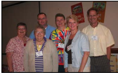
Iowa and Illinois