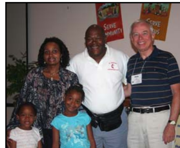
Our North Carolina contingency and the distance they traveled certainly deserves recognition as well.