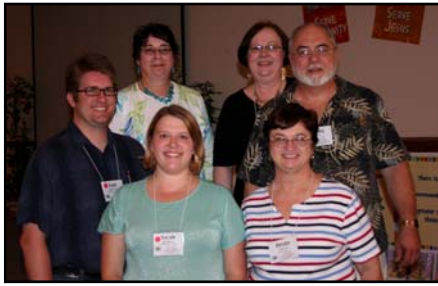
Those from Arkansas and Alabama .